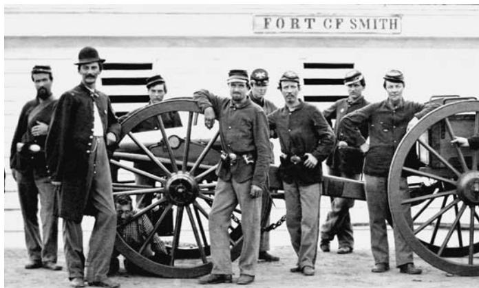
Civil War soldiers with cannon and caisson, Fort C.F. Smith, Co. L, 2d New York Artillery.

The American Civil War is also known as the War between the States. It was a war between the people in the northern states and those in the southern