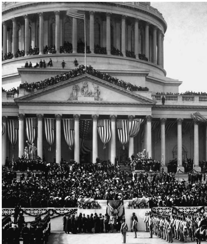
The inauguration of President Theodore Roosevelt on March 4, 1905.

Barack Obama is the 44th president of the United States. He won the presidential election of 2008 and became the first African American president of the United States. As president, he is the head of the executive branch. As commander in chief, he is also in charge of the military. Obama was born in Hawaii on August 4, 1961. He graduated from Columbia University in New York. Obama also studied law and graduated from Harvard University in Massachusetts. He served as a U.S. senator for the state of Illinois before being elected president. President Obama’s wife, called “the First Lady,” is Michelle Obama.