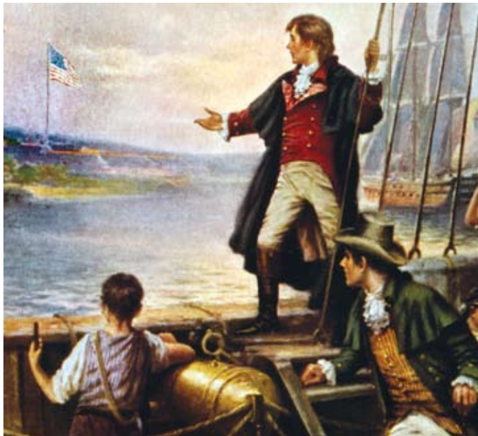
In “The Star-Spangled Banner,” by Percy Moran, Francis Scott Key reaches toward the flag flying over Fort McHenry.

In the United States, we celebrate Independence Day on July 4 to mark the anniversary of the adoption of the Declaration of Independence. After signing the Declaration of Independence, John Adams wrote to his wife, “I am apt to believe that it will be celebrated, by succeeding Generations, as the great anniversary Festival.” The Declaration of Independence, written by Thomas Jefferson, explained why the colonies had decided to separate from Great Britain. Americans celebrate the Fourth of July as the birthday of America, with parades, fireworks, patriotic songs, and readings of the Declaration of Independence.