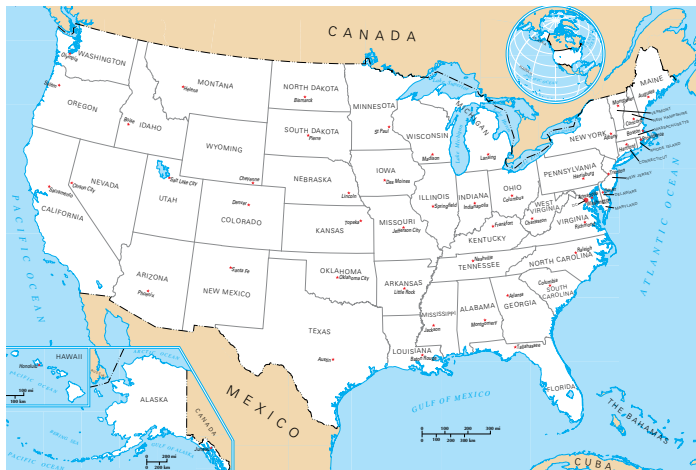
Map of the United States including state capitals. Courtesy of the National Atlas of the United States, March 5, 2003, http://nationalatlas.gov .

The Constitution did not establish political parties. President George Washington specifically warned against them. But early in U.S. history, two political