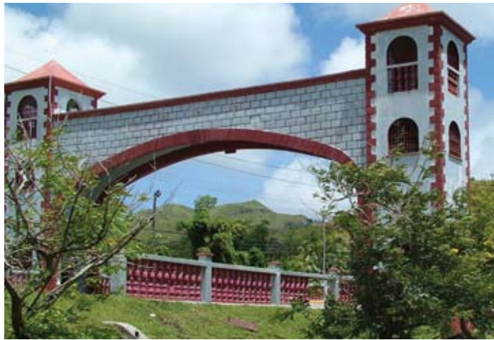
Old Spanish Bridge in Umatac, Guam.

The northern border of the United States stretches more than 5,000 miles from Maine in the East to Alaska in the West. There are 13 states on the border with Canada. The Treaty of Paris of 1783 established the official boundary between Canada and the United States after the Revolutionary War. Since that time, there have been land disputes, but they have been resolved through treaties. The International Boundary Commission, which is headed by two commissioners, one American and one Canadian, is responsible for maintaining the boundary.