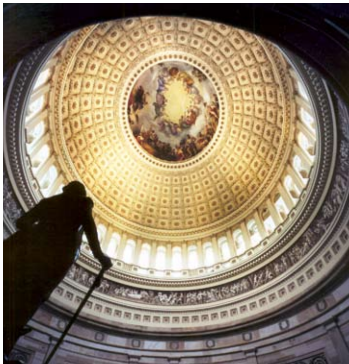
The Rotunda of the U.S. Capitol.

Congress is divided into two parts—the Senate and the House of Representatives. Because it has two “chambers,” the U.S. Congress is known as a “bicameral” legislature. The system of checks and balances works in Congress. Specific powers are assigned to each of these chambers. For example, only the Senate has the power to reject a treaty signed by the president or a person the president chooses to serve on the Supreme Court. Only the House of Representatives has the power to introduce a bill that requires Americans to pay taxes.