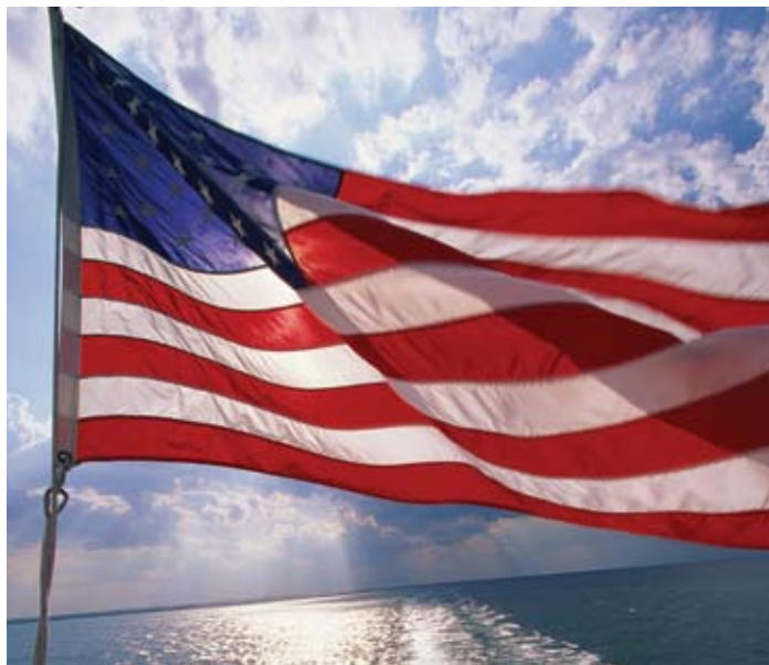
The American flag is an important symbol of the United States.

When the United States became an independent country, the Constitution gave Congress the power to establish a uniform rule of naturalization. Congress made rules about how immigrants could become citizens. Many of these requirements are still valid today, such as the requirements to live in the United States for a specific period of time, to be of good