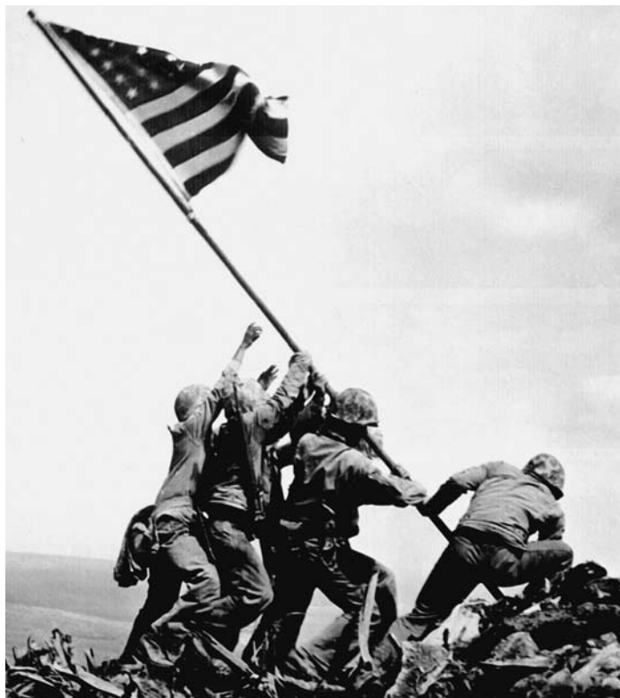
“Raising the Flag on Iwo Jima,” photographed by Joe Rosenthal, Associated Press, 1945. Courtesy of the National Archives, 80-G-413988.

From 1959 to 1975, United States Armed Forces and the South Vietnamese Army fought against the North Vietnamese in the Vietnam War. The United States supported the democratic government in the south of the country to help it resist pressure from the communist north. The war ended in 1975 with the temporary separation of the country into communist North Vietnam and democratic South Vietnam. In 1976, Vietnam was under total communist control.