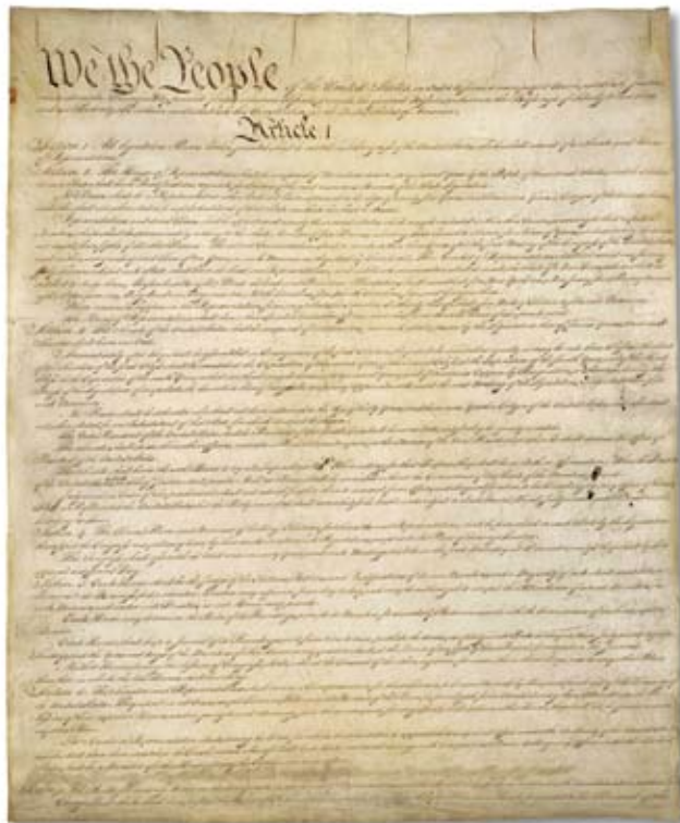
The Constitution of the United States.

The Constitutional Convention was held in Philadelphia, Pennsylvania, from May to September 1787. Fifty-five delegates from 12 of the original 13 states (except for Rhode Island) met to write amendments to the Articles of Confederation. The delegates met because many American leaders did not like the Articles. The national government under the Articles of Confederation was not strong enough. Instead of changing the Articles of Confederation, the delegates decided to create a new governing document with a stronger national government—the Constitution. Each state sent delegates, who worked for four months in secret to allow for free and open discussion as they wrote the new document. The delegates who attended the Constitutional Convention are called “the Framers.” On September 17, 1787, 39 of the delegates signed the new Constitution.