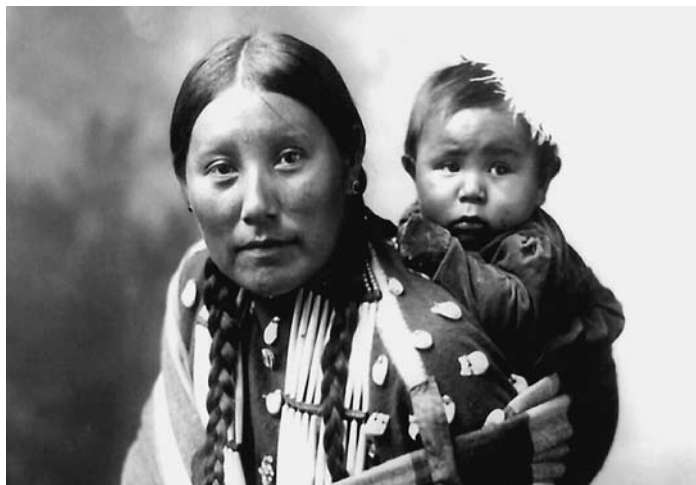
American Indian woman and her baby in 1899.

On September 11, 2001, four airplanes flying out of U.S. airports were taken over by terrorists from the Al-Qaeda network of Islamic extremists. Two of the planes crashed into the World Trade Center’s Twin Towers in New York City, destroying both buildings. One of the planes crashed into the Pentagon in Arlington, Virginia. The fourth plane, originally aimed at Washington, D.C., crashed in a field in Pennsylvania. Almost 3,000 people died in these attacks, most of them civilians. This was the worst attack on American soil in the history of the nation.