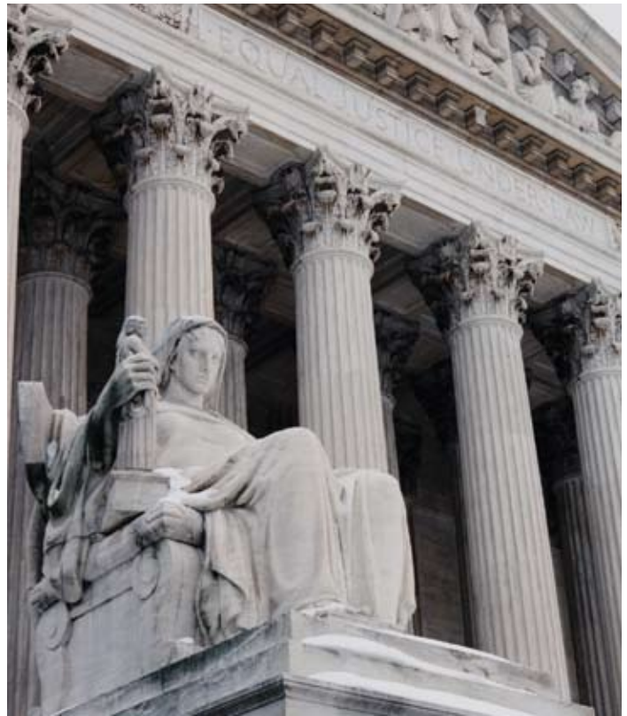
The Contemplation of Justice statue outside the U.S. Supreme Court building in Washington, D.C.

The judicial branch is one of the three branches of government. The Constitution established the judicial