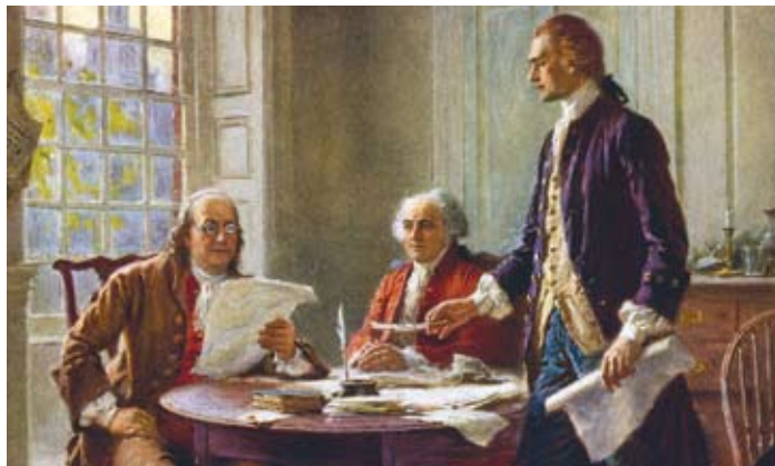
Benjamin Franklin, John Adams, and Thomas Jefferson in “Writing the Declaration of Independence, 1776,” by Jean Leon Gerome Ferris.

The Declaration of Independence lists three rights that the Founding Fathers considered to be natural and “unalienable.” They are the right to life, liberty, and the pursuit of happiness. These ideas about freedom and individual rights were the basis for declaring America’s independence. Thomas Jefferson and the other Founding Fathers believed that people are born with natural rights that no government can take away. Government exists to protect these rights. Because the people voluntarily give up power to a government, they can take that power back. The British government was not protecting the rights of the colonists, so the colonies took back their power and separated from Great Britain.